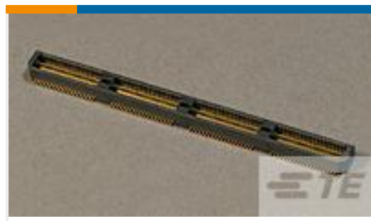
TE Part # 3-1658463-4 MSB0.80PL5ASY112DP,GP,30,VCTY