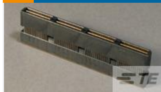
TE Part # 3-1658468-4 MSB0.80PL22ASY112DP,GP,30,VCTY