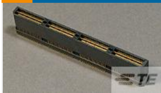
TE Part # 3-1658466-4 MSB0.80PL16ASY112DP,GP,30,VCTY