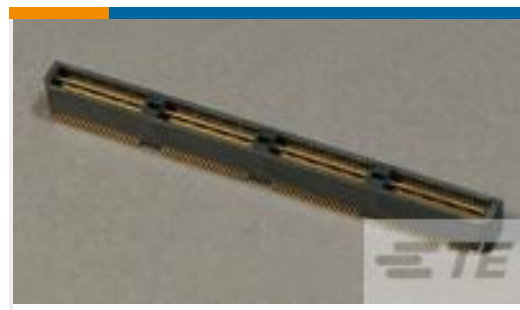
TE Part # 3-1658464-4 MSB0.80PL8ASY112DP,GP,30,VCTY