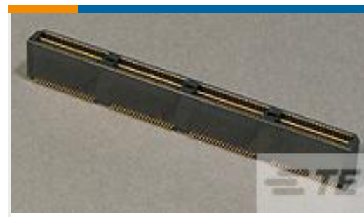
TE Part # 3-1658465-4 MSB0.80PL11ASY112DP,GP,30,VCTY